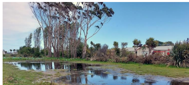
Image: The wetland to be restored.

Once the final design has been approved, we cannot wait to share it with whānau.